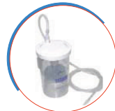
2 Ltr PC Jar

PUMP: But if accidentally the fluid enters the pump, pull the filter and run the unit keeping a thumb on the suction inlet for a minute or two. Unscrew and take out the pin from the vacuum control knob and with the pump still on, gradually pour, 15-20 drops of oil in it. Block the inlet "OFF" and "ON" for a couple of times. Put the knob pin and the filter in their respective places. If it does not start, please consult the hospital engineer or the electrician. If this exercise is not done immediately after the accidental entry of blood in the pump the blood will stick dry inside the pump.