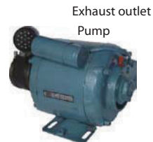
Exhaust outlet Pump